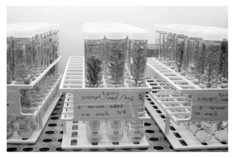
Figure 1. Experimental setup showing test tube racks with the three hydrilla genotypes and 10 replications per resistance level.

and Invasive Plants, Gainesville, Florida, in December 2007. Fluridone-susceptible hydrilla infested with H. pakistanae larvae was collected in a 19 L (5 gal) bucket and the top covered with Nitex® screen to trap emerging adult flies. The rearing procedure was similar to the one described by Goodson (1997). Samples of fluridone-susceptible, fly-free hydrilla were collected at the Santa Fe River in High Springs, Alachua County, Florida and placed into 3.8 L (1 gal) jars to establish a colony.