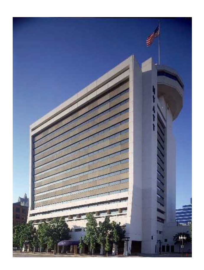
Hyatt Regency Milwaukee

The 49<sup>th</sup> Annual Meeting of the Aquatic Plant Management Society will be held July 12-15, 2009 at the Hyatt Regency Milwaukee, WI. The Hyatt Regency is a luxurious, full service hotel within walking distance of Lake Michigan. Located in downtown Milwaukee, the Hyatt Regency is connected to the Midwest Airlines Convention Center, Federal Plaza and Grand Avenue Mall. It is only two blocks from the Entertainment District and one block from the Riverwalk. Milwaukee is located on Lake Michigan, so plan on visiting one of the Great Lakes. A variety of restaurants are within easy walking distance.