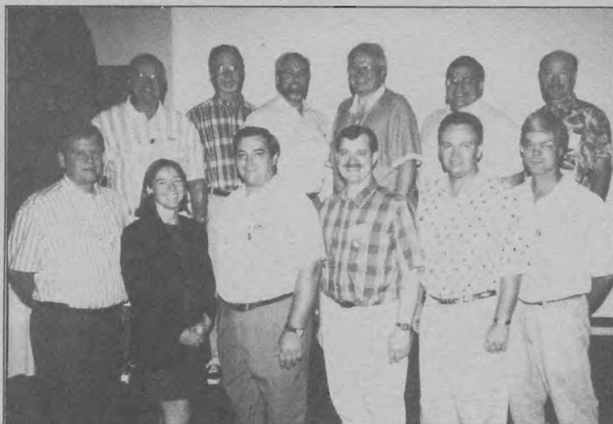
The above Board of Directors will serve during the 1998-99 business year.