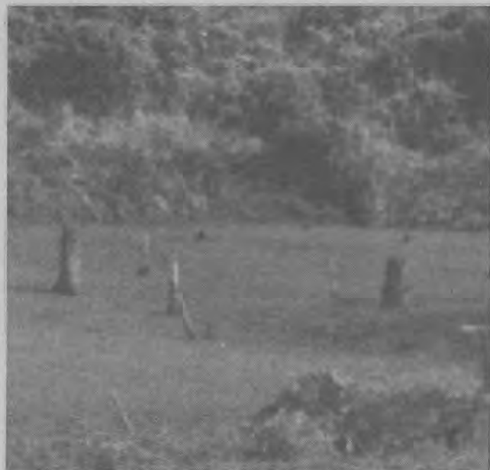
Figure 1. Giant Salvinia often forms dense mats over the surface of infested waterbodies. Treatment is hindered by the tendency of the free-floating plants to "stack-up", which essentially protects underlying plants from contact herbicides.

Further investigations by the authors and Ron Jones, USFWS, linked the Houston vicinity infestation to a nursery operator in Galveston County, and subsequently to other occurrences in several private ponds in