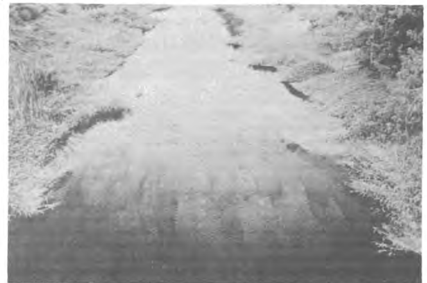
Hygrophila polysperma grows to the surface in eight feet deep water in the Felsmere Canal Near Melbourne, Fl. Vegetation breaks loose during high flow and clogs water control structures.

These aquatic weeds have the potential to become serious weeds in some parts of the U.S. if they continue to spread. One small population of E. azurea in Palm Beach, Florida, was