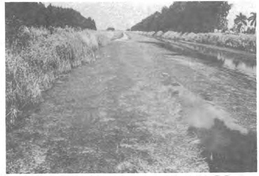
Hydrilla verticillata in North New River Canal, Ft. Lauderdale, Fl. Dense growth such as this are serious flood hazards.

ious Weeds are being sold in interstate commerce as pond ornamentals or as vegetables. These include: