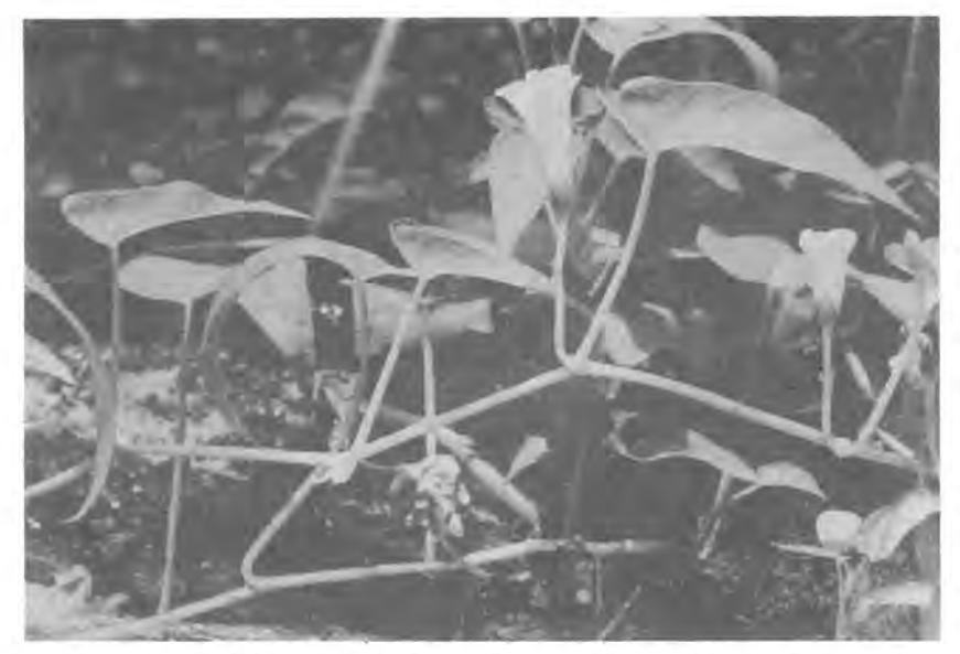
Ipomoea aquatica is already widespread in cultivation in Florida and will likely escape to cause problems in the future.

eliminated by the Florida Department of Natural Resources (FDNR) in June, 1988. FDNR was alerted of its presence by an aquatic plant dealer in South Florida. The plants had been purchased from a mail order aquatic plant dealer in Independence, Ohio.